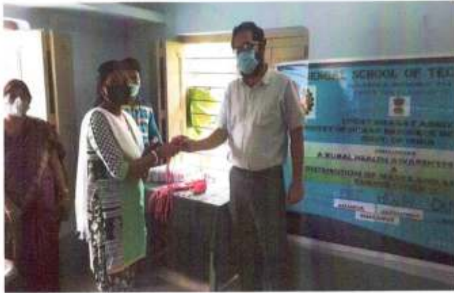
DISTRIBUTION CENTER- AMARPUR