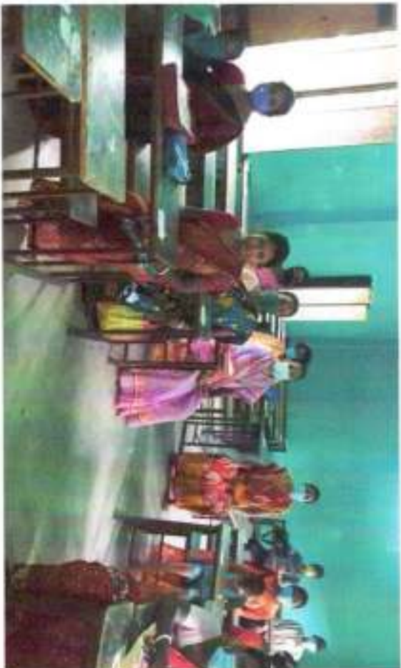
DISTRIBUTION CENTER- SUGANDHA