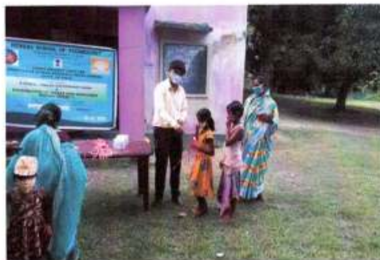
DISTRIBUTION CENTER- KAMDEBPUR