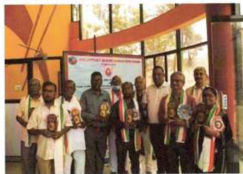
Blood donation camp