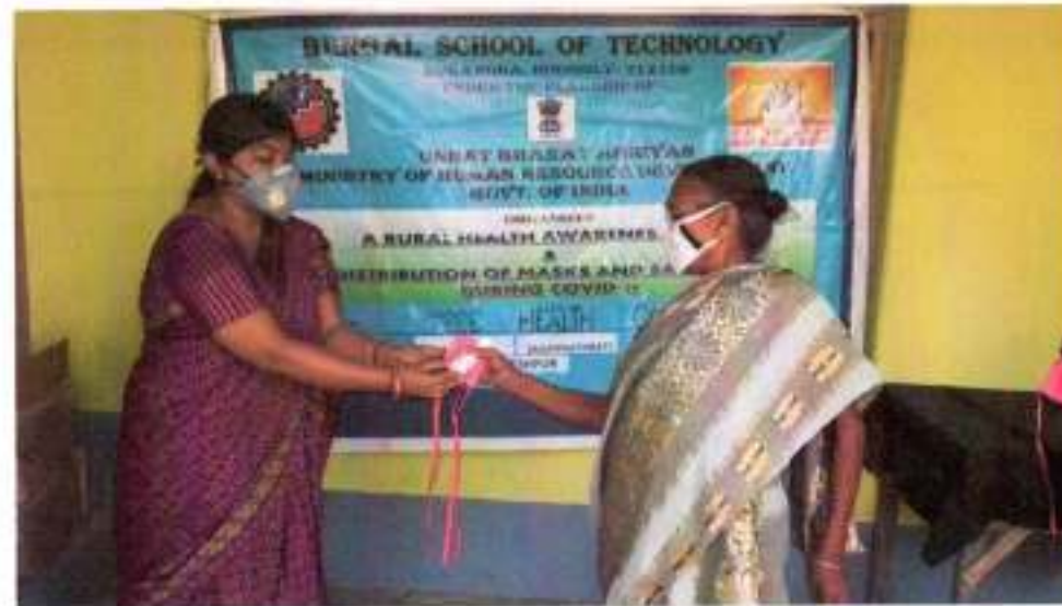
DISTRIBUTION CENTER- JAGANNATHBATI