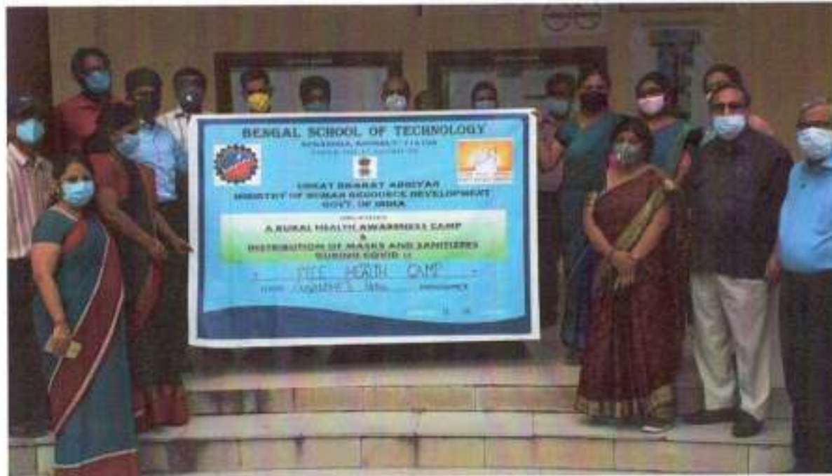
FACULTY OF BENGAL SCHOOL OF TECHNOLOGY