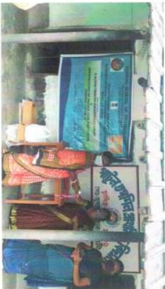
DISTRIBUTION CENTER- PATUL