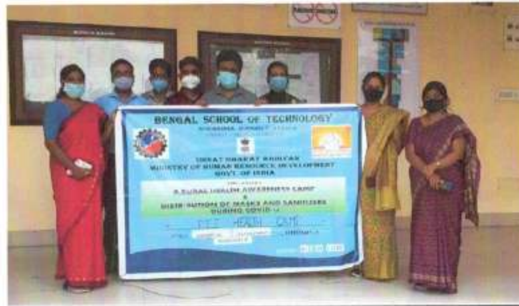
FACULTY OF BENGAL SCHOOL OF TECHNOLOGY